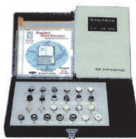
Group 1~6 : 25 types each Group 7 : 23 types

Standard pieces of metal material microstructures, and detailed explanations with photographs and CD-ROM.