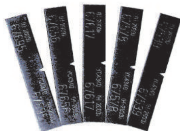
Type A Energy Level approx. 30J Type B approx. 100J Type C approx. 160J 5 pieces each energy levels per 1set