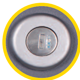
Door locks and additional space for padlocks on all models