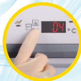
Digital temperature controller with intuitive interface