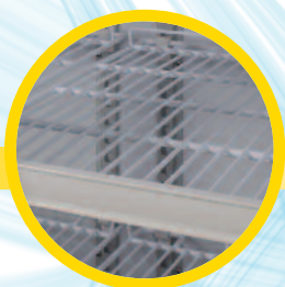
Configurative and adjustable shelving in lab refrigerators; continuous shelving on double-door models (no obstructions)