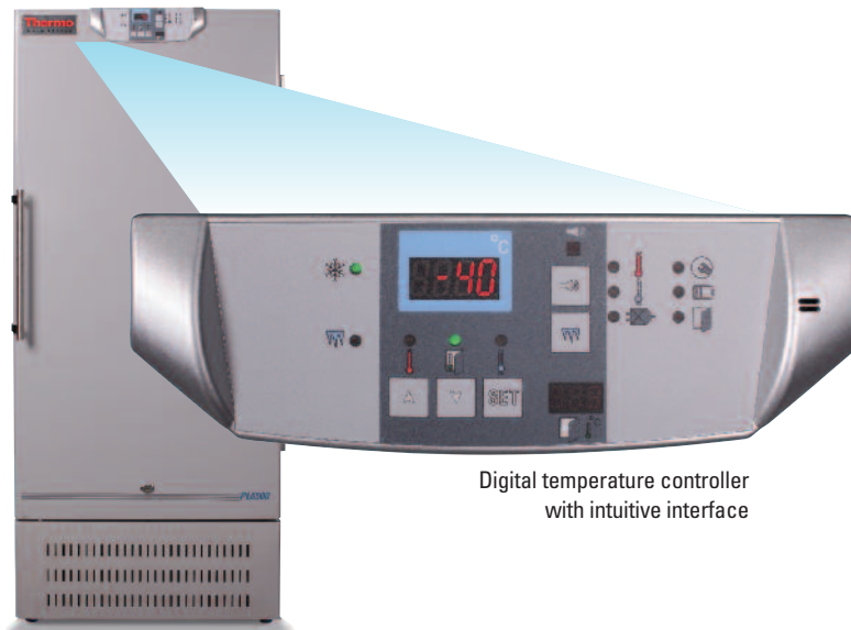
Digital temperature controller with intuitive interface