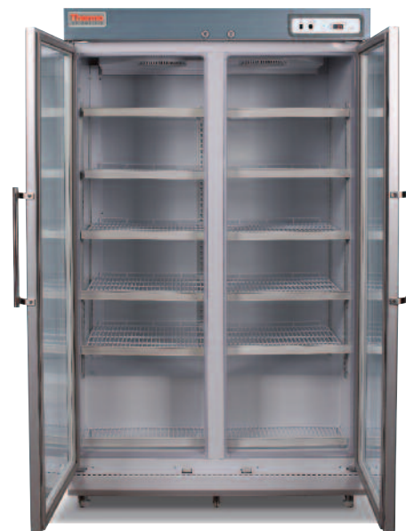
Shown left to right: Lab refrigerators PLR221, PLR386, PLR1006; Lab freezer PLF276