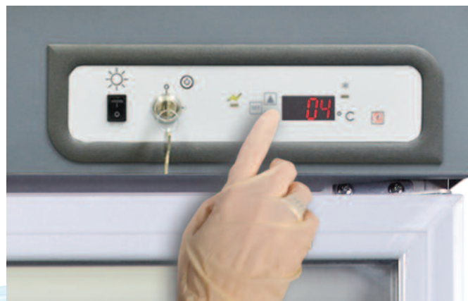
Thermo Scientific PL6500 Lab Refrigerators and Freezers

reliable cold storage for general-purpose applications