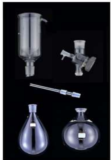
T (dewar-type cooler) type glass set The Dewar-type cooler is suitable for recovery of low-boiling substances using ice or dry ice-acetone in the cooler.

Glass set with S (horizontal double-tube condenser) type Horizontal double-tube condenser can efficiently recover vapor from low-boiling substances to highboiling substances.